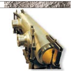
Manifold (1-7 tonnes/section)

Component for offshore use (4-15 tonnes)